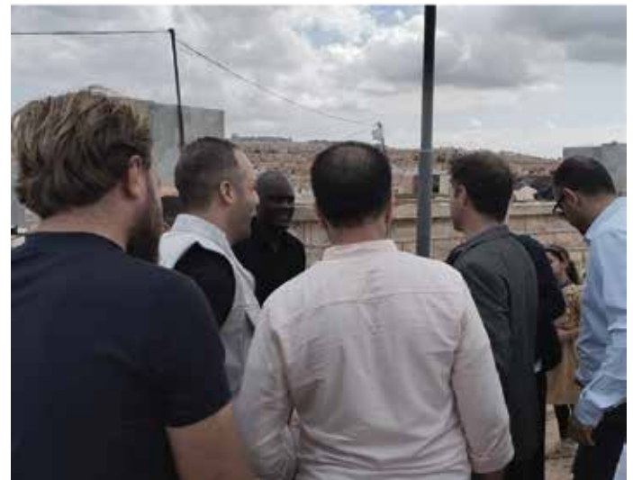
Al Zohoor Idp Site 3 October 2024

The Global Cluster coordinator engaged with local authorities, cluster partners, and donors supporting the humanitarian response in Northwest Syria and IDP communities in displacement sites.