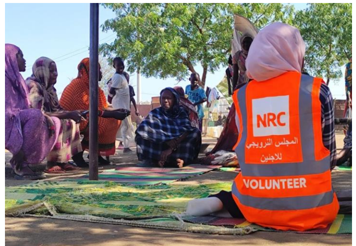
Left: Site management capacity-building in the Wadi Halfa, Right: Community engagement session by NRC in Gedaref