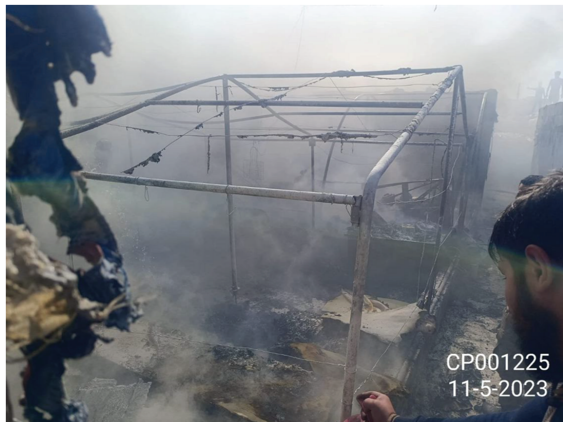
Fire incident in New Bab Al Salame IDP Site

Urgent needs ranged from non-food items (NFI) and tents to food and infrastructure repairs. As a result of these incidents, many IDPs lost NFIs, furniture and personal belongings.