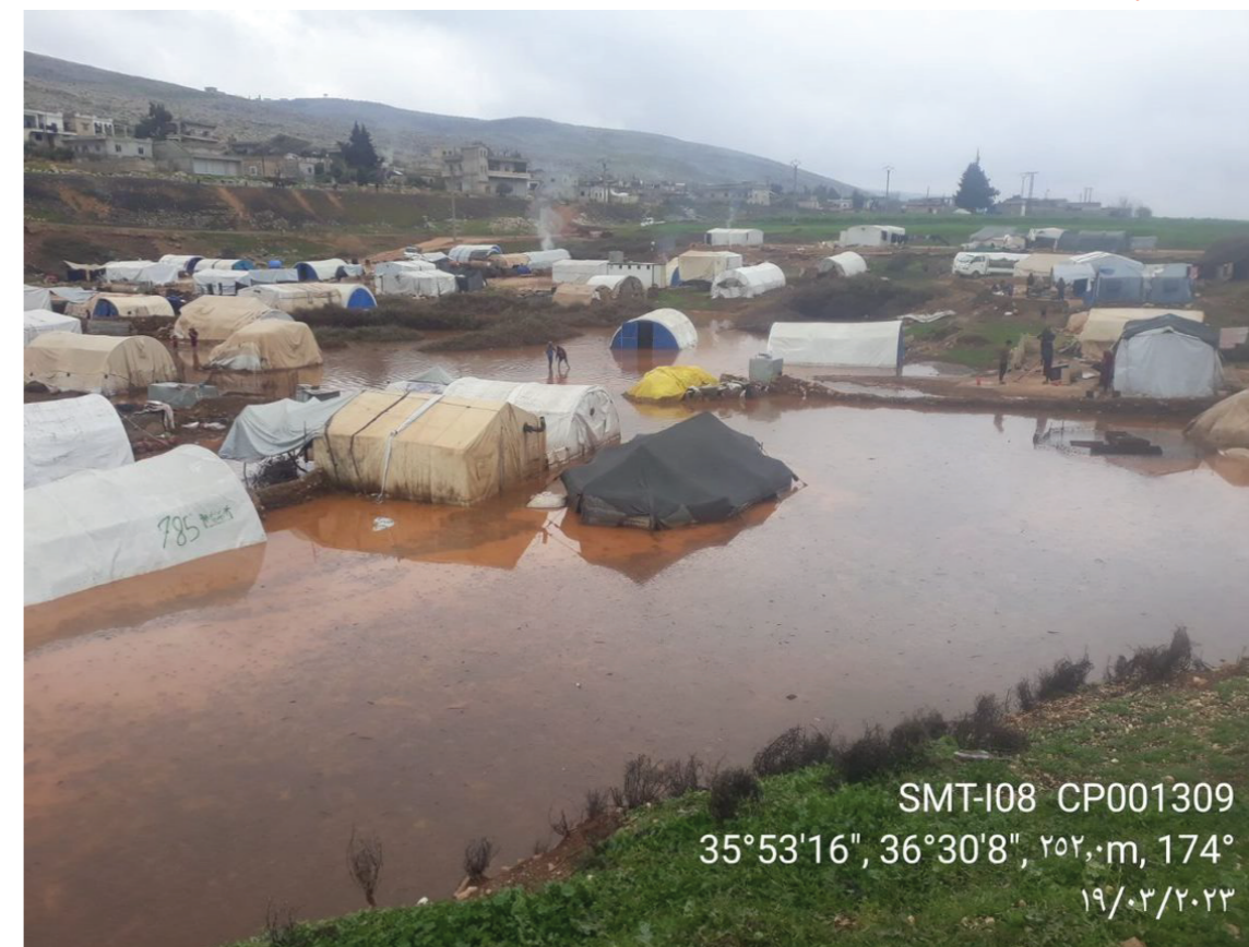
Flood Incident in Eudwan IDP Site 19/03/20