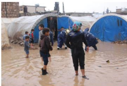
Dabiq IDP Site in Aleppo

Flood and fire incidents impacted 418 sites in January 2021 in north-west Syria (NWS), according to the CCCM Cluster's reporting tools. The top three affected sub-districts were Maaret Tamsrin (183 sites), Dana (80 sites) and A'zaz (31 sites); and the main urgent needs included tents, non-food items (NFI) and gravelling. As a result of these incidents, many IDPs lost NFI, furniture and personal belongings. Areas with concrete shelters were reported as being more resistant (for example Atma, Qah, Karama and Salam); while the least resistant areas were newly established or relocated IDP sites, or sites in flood-prone areas such as valleys or agricultural land. Heavy rains and strong winds affected the roads to and within the sites. IDP families with the support of the civil defence, local authorities and/or NGOs were able to open rain drainage and remove water from the tents. Sewage systems were also flooded causing sewage water to enter and damage tents.