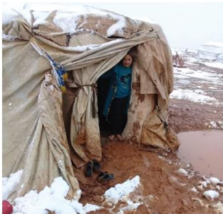
Wash IDP Site in Aleppo